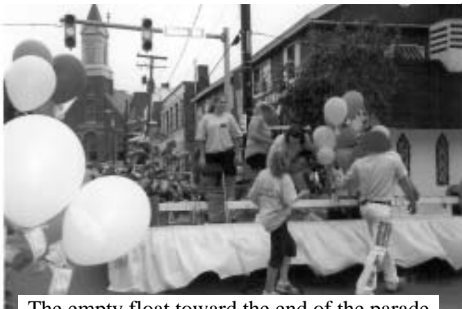
The empty float toward the end of the parade