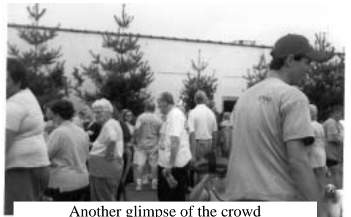
Another glimpse of the crowd