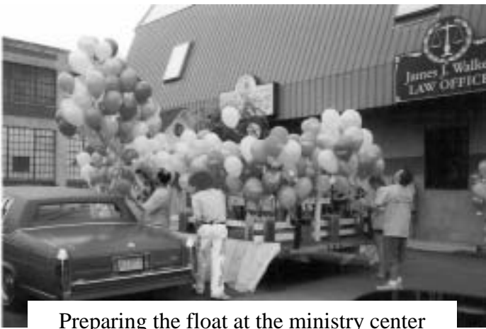
Preparing the float at the ministry center