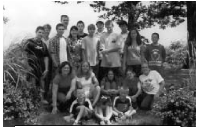
Marilla Missions Team 2003