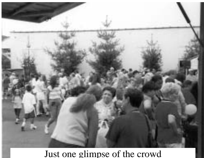
Just one glimpse of the crowd